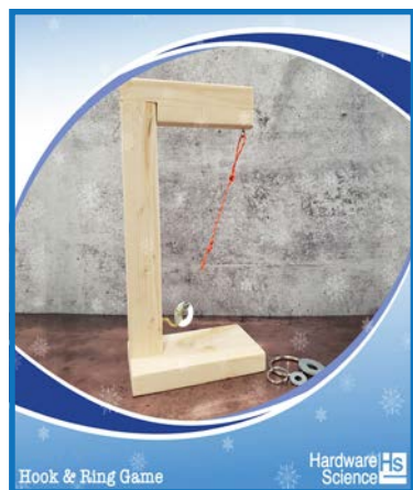
Hook & Ring Game